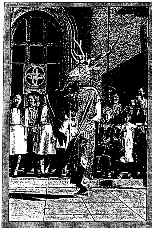
Mongolian dancer in traditional costume entertains Beijing Express riders.

19 initiated a declaration to be taken to Beijing, signed by representatives of almost every country, detailing recommended changes to laws regarding non-profit organizations. Many of the women made post-Beijing plans to work together.