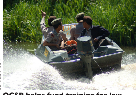
OCSP helps fund training for law enforcement officers.