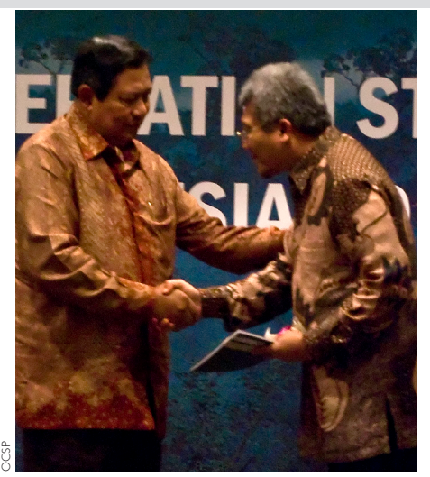
President Susilo Bambang Yudhoy ono congratulates the Minister of Forestry, MS Kaban, on the launch of the Orangutan Action Plan.

Peter Garret, Australia's Minister for the Environment, applauded the Indonesian government's efforts and emphasized how the protection of globally important biodiversity can follow from efforts to save forests and reduce carbon emissions: "There is a great deal of discussion here in Bali about the impacts of deforestation, forest degradation, and the need for forest manage-