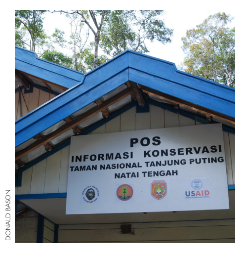
OCSP supports patrols at Tanjung Puting National Park, which protects one of the largest wild orangutan populations in the world.

OCSP is also exploring alternative means of financing for orangutan conservation including carbon credits through avoided deforestation and debt for nature swaps.