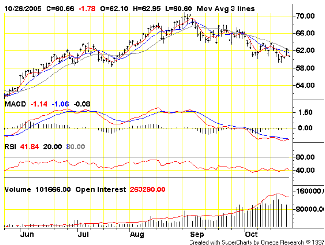
Figure 5-2 Crude Oil Prices—June–October 2005