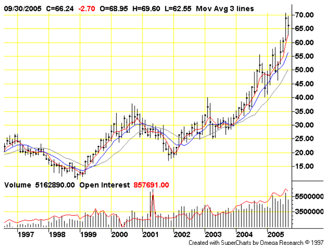
Figure 5-1 Crude Oil Prices—1997–2005