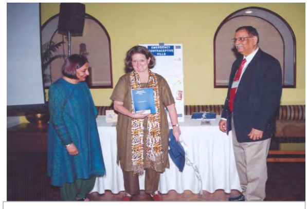
Release of ECP Training Manual

To disseminate information on ECP among health providers, MOHFW asked FRONTIERS to write an article for publication in its National Rural Health Mission's newsletter, a bimonthly newsletter printed in English, Hindi, Urdu, Oriya, and Assamese. The newsletter, distributed to public-sector providers at the level of ANMs, reaches about 300,000 individuals and provides information on government initiatives in health and family welfare and new technical developments. The article was published in the January 2007 issue of the newsletter (see Appendix B).