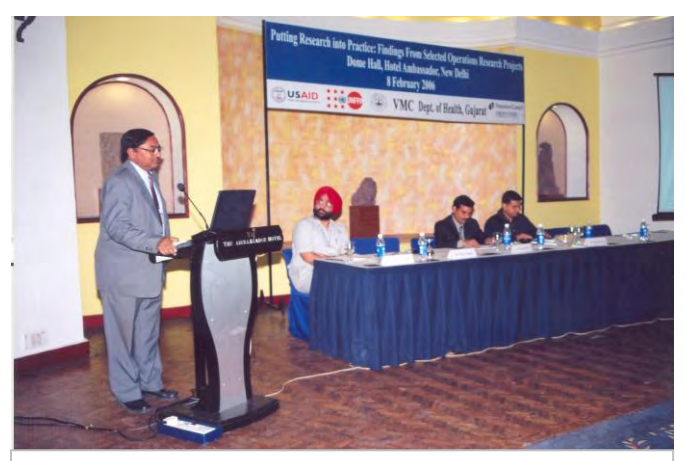
Presentation of study findings at the dissemination meeting

The study was designed recognizing the need for policy changes to allow provision of ECP services through paraprofessionals rather than restricting its provision on prescription by