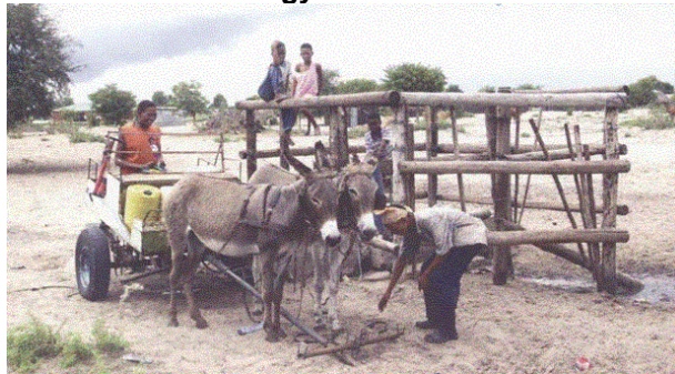
Borehole Technology Provides Potable Water

Delta and Chobe River systems. 53 In the north and east, surface water is widespread during the rainy season, mostly in dams and shallow wells. In the west, which is generally dry except for ephemeral pools in pans and fossil rivers, water is obtained from hand-dug wells or deep boreholes. Botswana has experienced 12 drought years in the past 22, on a regular, cyclical basis. Water management is critical, as groundwater and river