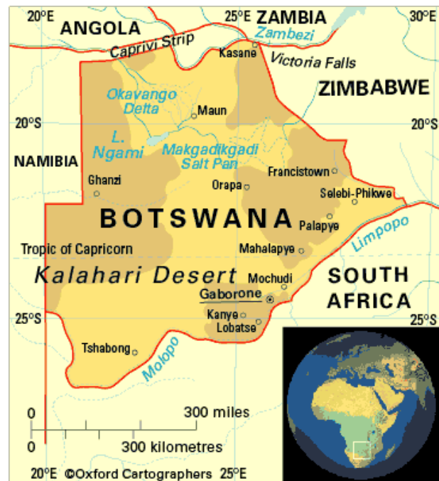
Kalahari Desert Dominates Botswana

Natural resources include diamonds, copper, nickel, salt, coal, soda ash (used in glassmaking and fertilizer), iron ore, silver, gold, and uranium (discovered in 2007). There is also a variety of wildlife, including leopard, lion, buffalo, giraffe, wild dog,