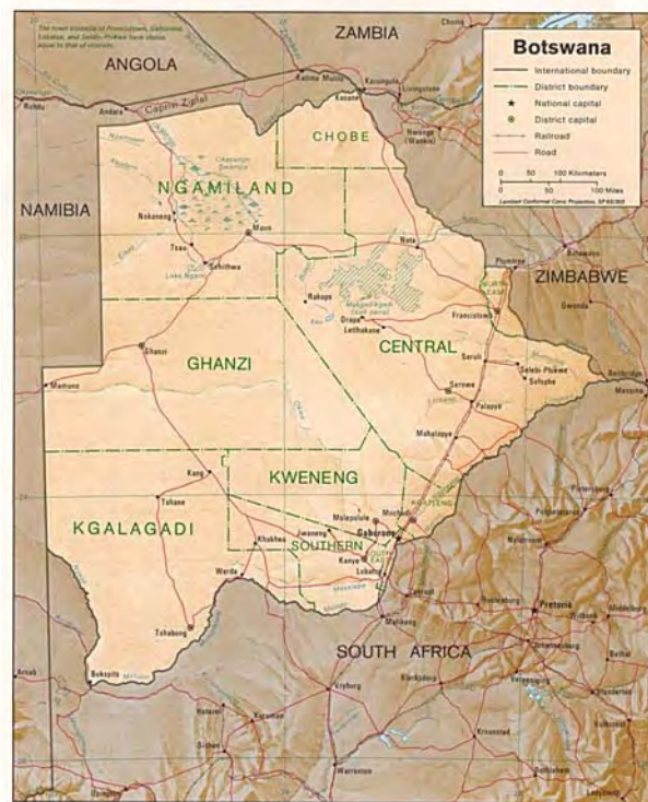
Botswana's Nine Districts

Source: http://en.wikipedia.org/wiki/Botswana