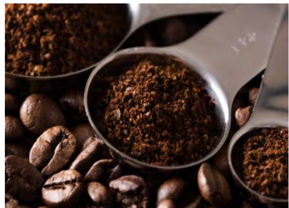
Rwanda, who now supplies coffee for Starbucks' Blue Bourbon brand is one of a select group of Starbucks' Black Apron Exclusives line of world class specialty coffees.

Prior to 2001, Rwanda was an unknown in the specialty/high-value coffee sector. Today, Rwanda is a sought-after market supplying specialty coffee to Starbucks and other premium coffee buyers throughout Europe and the United States. The transformation is due to the combined efforts of the local producers, the Government of Rwanda, USAID donor projects, and international buyers. This case focuses on the role of the USAID donor projects in upgrading the quality of supply and then facilitating the initial linkage with international buyers. The case illustrates best-practice training and facilitation in preparing a product to meet international quality standards and attracting the interest of international buyers. Finally, the case highlights the continuing need to build the capacity of local suppliers in marketing and commercial relationship management.