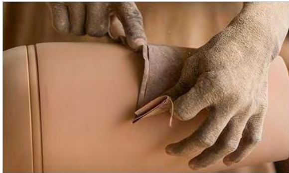
Tekura artisan finishing a wooden vase

In Ghana, a Ghanaian entrepreneur with local production expertise, a tested product portfolio, and a network of international buyers develops relationships with a number of big-box retailers. This case tracks the relationship between Ghanaian handicraft manufacturers, (Tekura Enterprise Ltd, and others) and end buyers (Pier One, MarMaxx, and Target) in the United States. The case will highlight the benefits and risks suppliers can experience when doing business with big box retailers. The case reveals the importance of the supplier's ability to access timely end-market information in order to track changes in customer preferences and anticipate changes in the buyers' needs. In addition, this case explores the importance of pre-emptive and continual innovation of product design in order to mitigate the risk replication (copy-cat competition), help protect margins, and build demand in new markets.