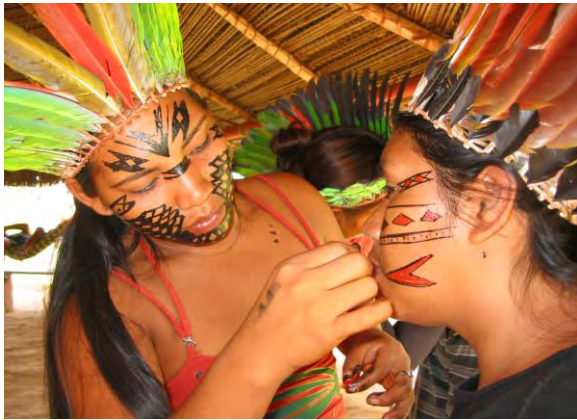
The Yawanawa tribe of Brazil continues to supply US cosmetics producer Aveda with a unique natural and organic product for a specialty line of cosmetics.

In Brazil, an indigenous tribe produces a pigment used by an international cosmetics company for its specialty product line. The relationship enabled the tribe to become economically independent and supplied the cosmetics company with a unique natural and organic product, but was heavily reliant on an unusual type of facilitator to solidify the buyer-supplier relationship. This case tracks the relationship between the Brazilian Yawanawa tribe that produces uruku pigment, and the