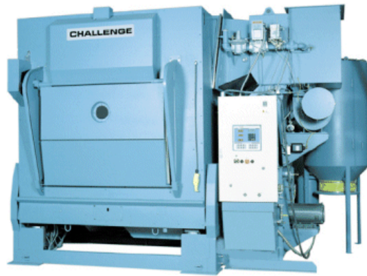
Figure 2. Washex Challenge CPG 600 industrial dryer.

After the chemical application process is complete, the treated nets are transported from the washer/extractor to an industrial gas fired or steam heated dryer such as the Washex Challenge CPG 600 shown in Figure 2. Net transportation options range from manual carts and overhead sling systems to fully automated conveyor handling systems.