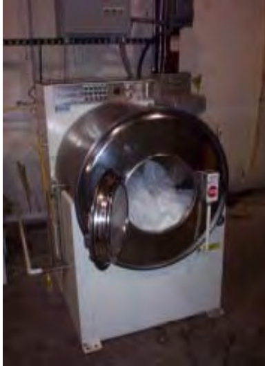
Figure 3. 50 pound Milnor washer/extractor installed at Anovotek, LLC laboratory.

The pilot-scale washer/extractor and chemical addition system has the following basic specifications: