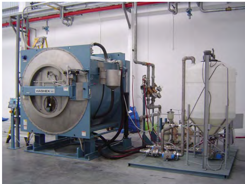
Figure 6. LLIN Chemical Feed System engineered, built and integrated into Washex DPM 5000 washer/extractor by Texchine, Inc.