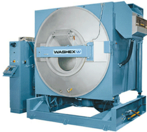
Figure 1. Washex DPM 5000 end-loading washer/extractor.

After the chemical application process is complete, the treated nets are transported from the washer/extractor to an industrial gas fired or steam heated dryer such as the Washex Challenge CPG 600 shown in Figure 2. Net transportation options range from manual carts and overhead sling systems to fully automated conveyor handling systems.