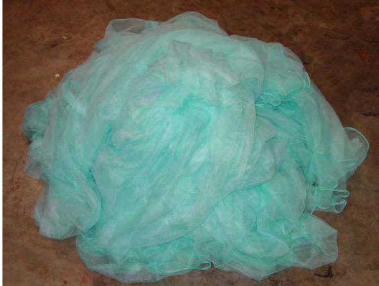
Figure 5. Five (5) nets treated with tint over a 5 minute time period and then allowed to tumble for an additional 15 minutes (note the consistency of color between the nets).

As shown in Table II, wet pick-up of the nets averaged 49.3%, and the standard deviation of net-to-net wet pick-up was quite low.