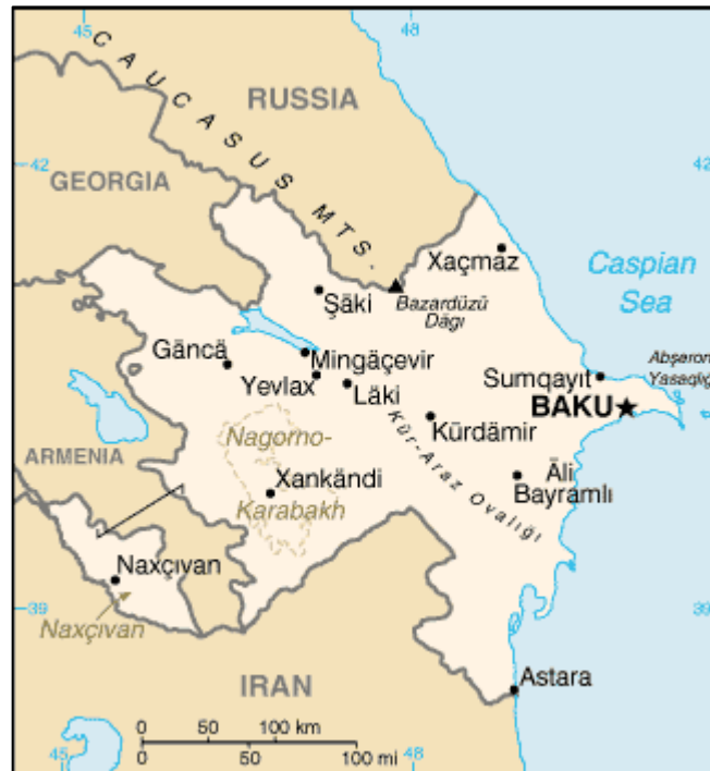
Figure 1: Azerbaijan and the Caucasus Region

Azerbaijan, a country of 8 million people, lies in southwestern Asia and is bordered to the north by Russia, to the south by Iran, to the east by the Caspian Sea, and to the west by Armenia and Georgia (Figure 1). More than 90% of its population is Muslim and ethnic Azeri. Since the collapse of the Soviet Union in 1991, Azerbaijan has been independent. An oil-rich nation since the turn of the century, recent investments have enhanced capacity and the potential for increased oil revenue, boosted by the recent construction of new oil and gas pipelines to the Mediterranean. Despite this, the gross domestic product (GDP) per capita in 2005 was estimated at less than $5,000. The events of the last 15 years and the political and economic transformation have had implications for social services. While such indicators of health and prosperity as life expectancy and literacy remain high, much remains to be done to bring Azerbaijan into line with its neighbors in Europe, particularly in the area of primary health care provision and reproductive health (RH).