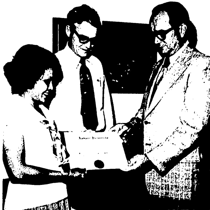
Philippine biologist completes 6 weeks of special training at Auburn.

Specific work plans to achieve each of these objectives were developed at the beginning of the grant extension. These plans outline the activities of each principle person supported under the AID grant.