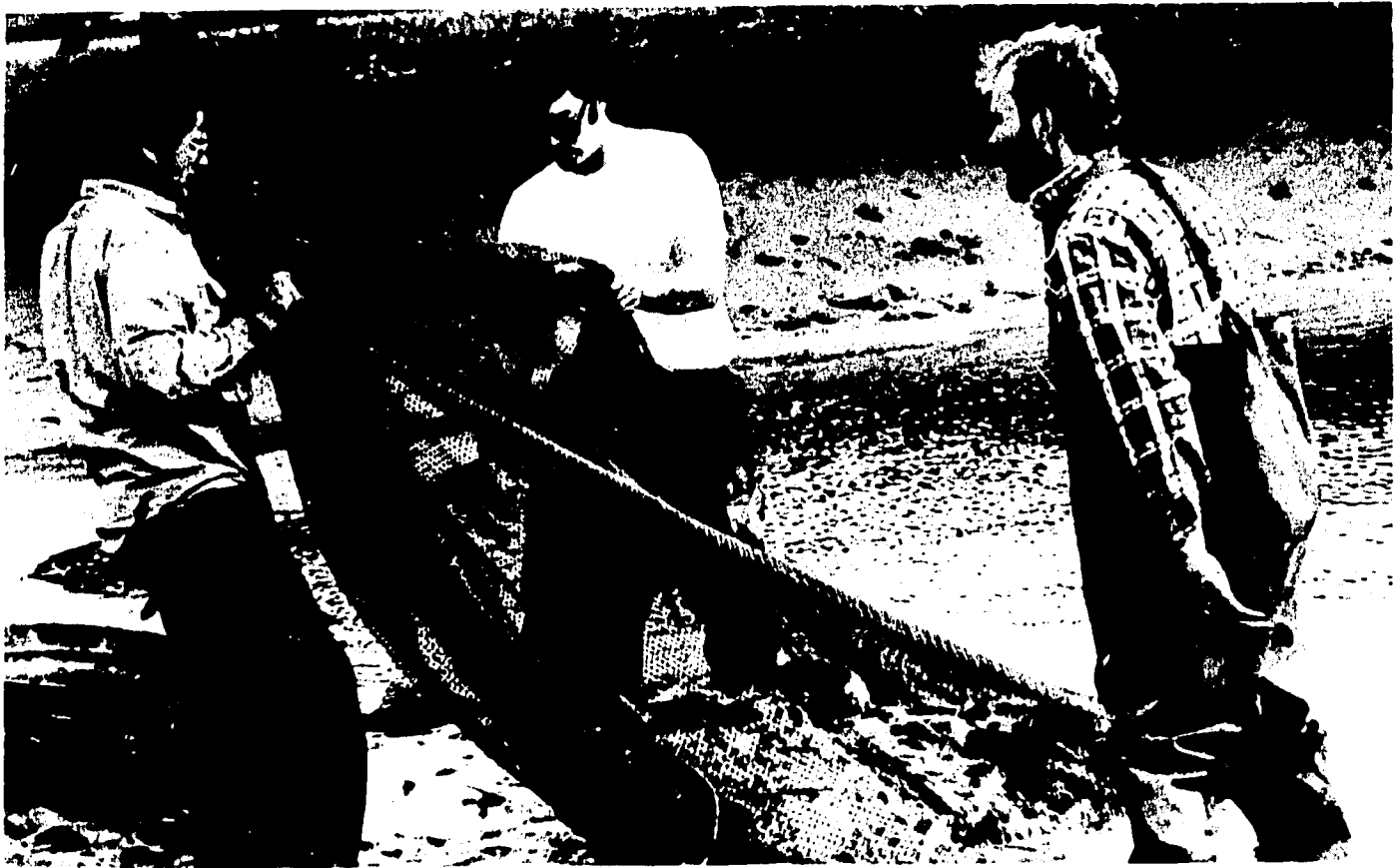
Peace Corps trainees get experience with pond seining.

the United States and have recently worked in aquaculture in an LDC.