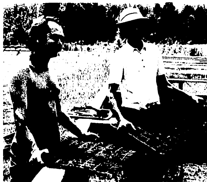
Students collect carp eggs as part of their practical training.

New courses to be developed included one in fish seed production. The 1975 goal was to prepare a course outline and plan facilities and training aids. This was accomplished by Jack Snow who, besides preparing the material, used parts of it during the non-degree training program. A training syllabus for the course was 40 percent drafted and visual aid materials were developed. A series of 263 Kodachrome slides (35-mm) were obtained and organized into several illustrated lectures to pre-