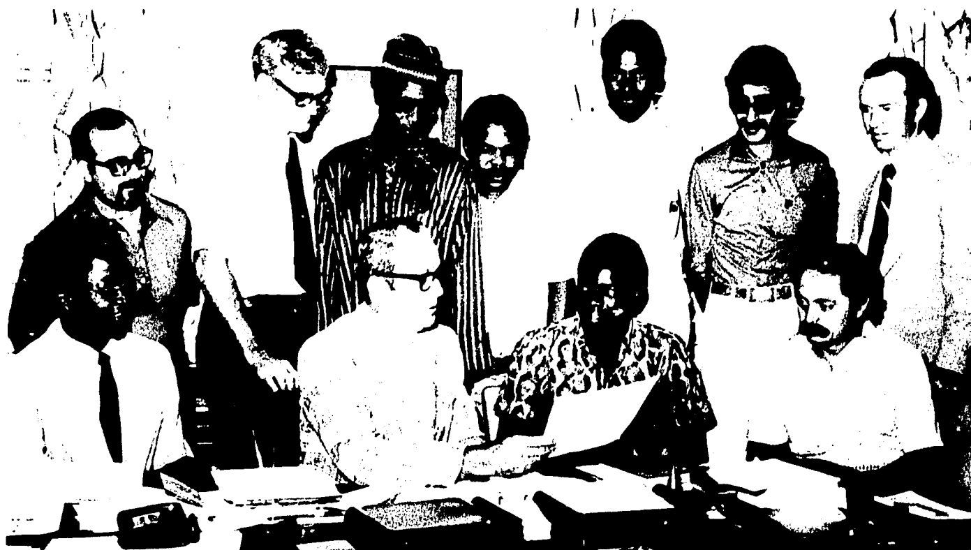
Awarding of certificates at completion of 5-month aquaculture training program.

A state-of-the-art survey in aquaculture was initiated to determine the nature and extent of aquaculture in the less developed countries. Presently information has been collected from various sources for 77 LDCs. A questionnaire was developed to gather information on types of fish cultured, techniques used, production cost, marketing, types of minimum input aquaculture being conducted, types of research being conducted, and nature of extension programs being carried out in fisheries. These questionnaires were mailed to 230 individuals either currently working in an LDC or those who have been there recently. Presently, 71 replies have been received. Follow-up letters have been mailed to individuals who did not reply initially. Interviews have been conducted with individuals who are in