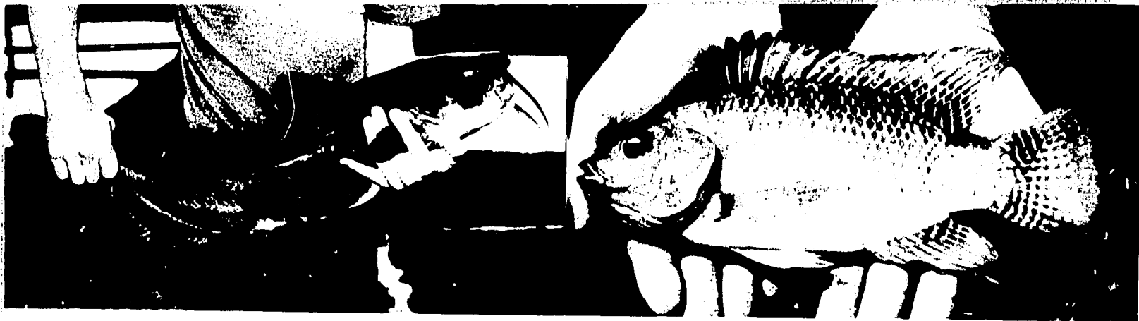
Brand marked channel catfish brooder used in genetic studies, left, and fast growing tilapia hybrid Sarotherodon niloticus (female) x S. honorum (male), right.

incorporated the level of available resources for aquaculture and the attitude of farm operators towards aquacultural production. Using currently available cultured species and production techniques a system of production will be developed to utilize the resources farmers currently have available.