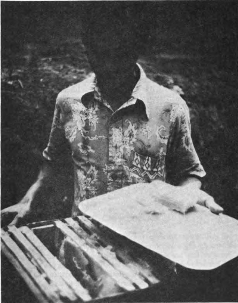
Gunung Arca, West Java. Calliandra honey. Calliandra's flowering is so prolific that by 1979 some 650 beehives, layed out alongside trails through part of the forest, were each producing about 1.3 kg of calliandra honey per month. (N.D. Vietmeyer)

As already noted, the calliandra bush is an attractive ornamental and makes useful hedges with beautiful red flowers. Indonesians recommend calliandra for planting along roadsides, village boundaries, fields, dikes, canals, and forests.