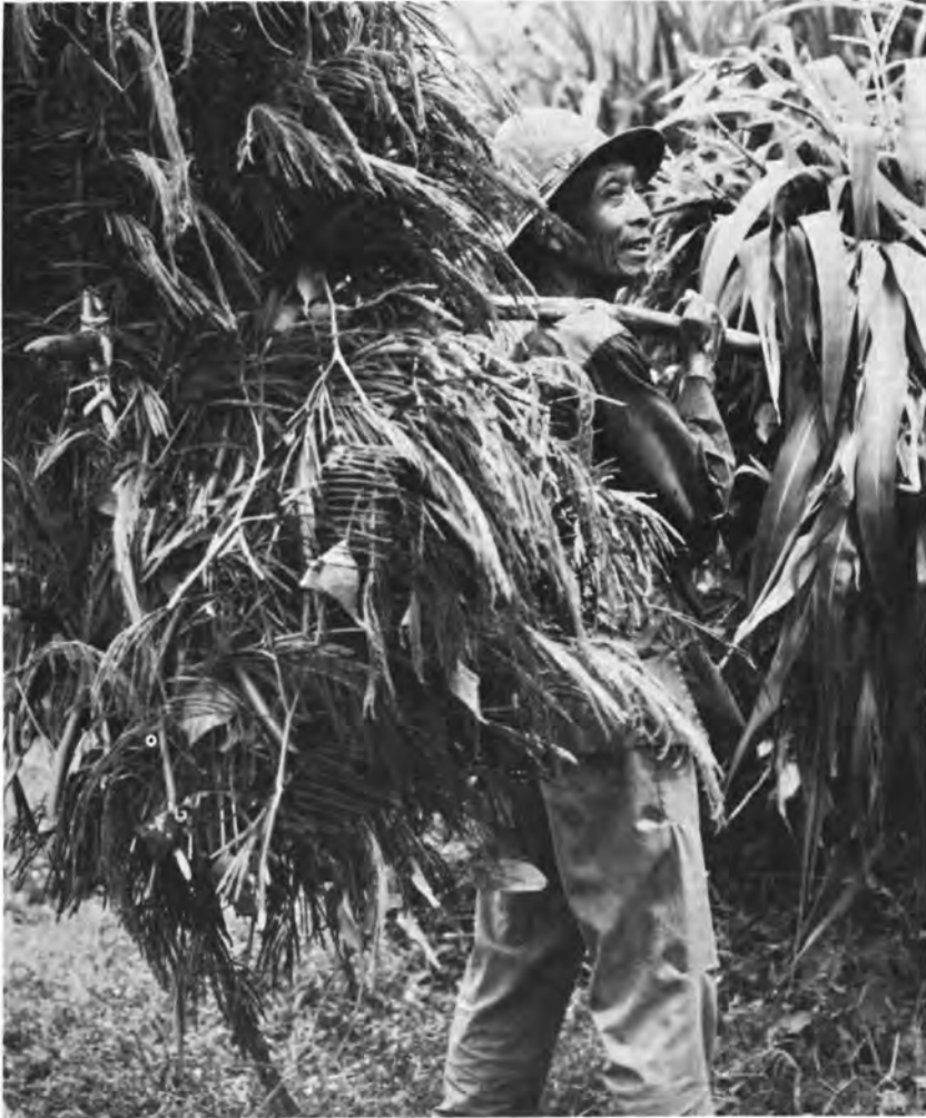
Toyomerto village, East Java. Calliandra's value as forage is untested in widescale practice, but many Indonesian villagers routinely feed it to livestock. Here, a mixed load of calliandra foliage and sugarcane tops is on its way to feed the family cows.

Indonesian rural communities frequently cut calliandra leaves to feed their livestock. Annual yields of 7-10 tons of dry fodder per hectare have been recorded. Calliandra is already grown for fodder, together with elephant grass, in large areas of Java previously unable to support any economic crop. Thus, forage production, perhaps in a silvipastoral system, is a promising use of the plant.