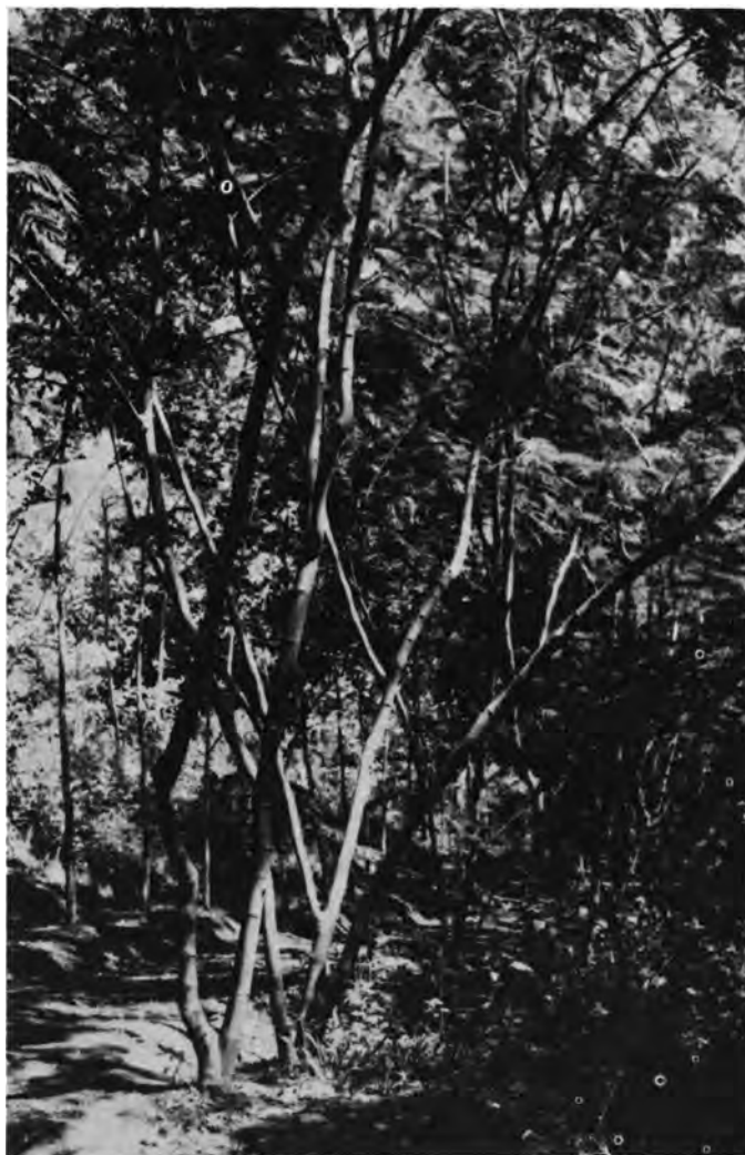
East Java. Calliandra trees about 3 years old planted on formerly deforested land. Unlike traditional forestry species, calliandra is small, many-branched, and often crooked. The wood is too small for most conventional purposes and its main promise is for helping rural areas of the humid tropics fulfill their pressing needs for fuelwood. At the same time, calliandra may provide forage, honey, small wood products, soil improvement, erosion control, shade, and beautification. (R.I.S. Pramoedibjo)