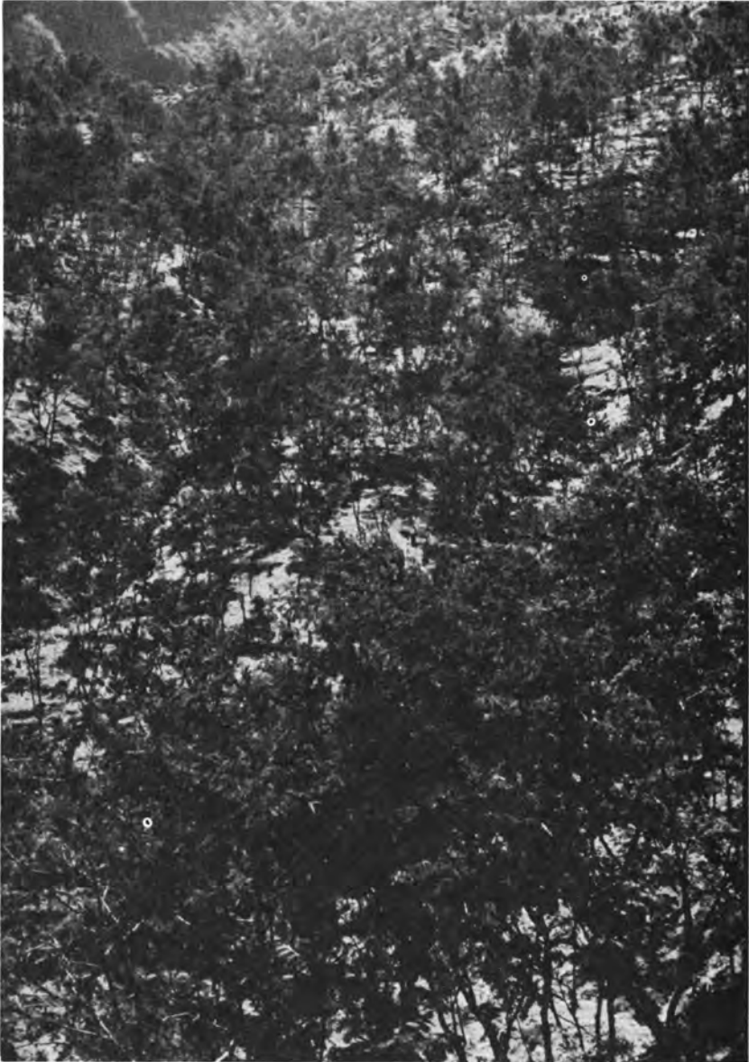
Slopes of Mount Merapi, Central Java. Gardens and hillslopes are now planted in calliandra. The people of the nearby 760-family village keep beehives among the trees. Firewood and forage also come from the calliandra, much of which is planted amongst the Perum Perhutani forest of Acacia mearnsii and Pinus merkusii . Calliandra also has been planted to stabilize the steep gorges on the volcano sides in the background.