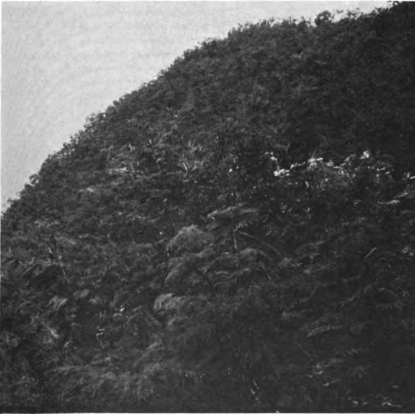
Near Selecta, East Java. Reforestation of steep hillslopes. Calliandra's dense growth suppresses weeds and quickly provides ground cover and protection from rain and wind. Indonesian foresters use it for stabilizing eroding slopes. Calliandra has also been used as a fire-break to block the passage of grass fires. (K.F. Wiersum)

Calliandra can be planted beneath stands of other trees. For example, it is being grown beneath stands of pines at both Tawangmangu and Deles on Java. Two-year-old calliandra grown beneath Pinus merkusii at Tawangmangu have yielded 60-70 stacked-meters of firewood per hectare. Elsewhere on Java it is planted beneath Eucalyptus deglupta .