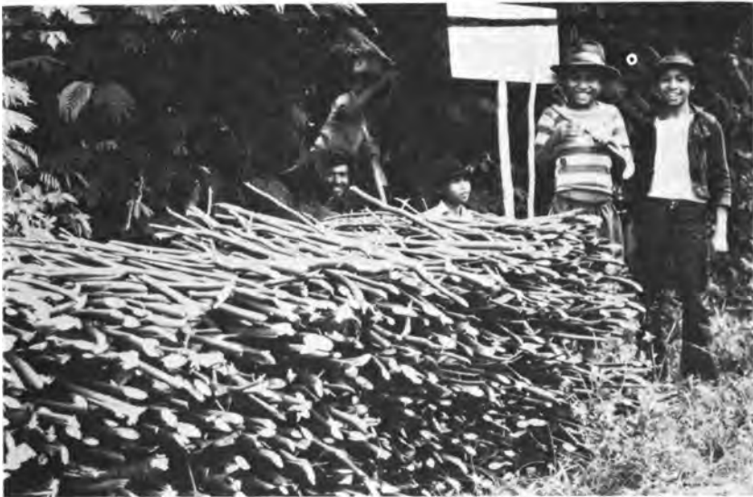
Toyomerto village, East Java. Calliandra wood is well sized for household cooking; it dries quickly and villagers often use it for fuel after only 6 days in these stacks.

Villagers favor calliandra because it is easy to establish, produces fuel-wood quickly, is simple to harvest, and resprouts readily. The wood dries rapidly and, if necessary, can be used for fuel after only 6 days. (However, the cut branches are usually left on the ground a week or two for