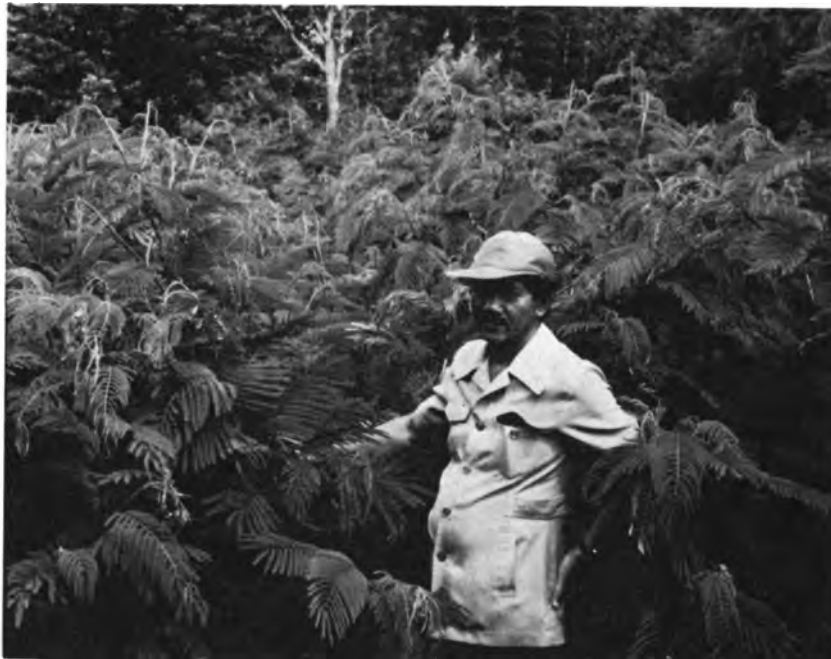
After cutting, calliandra sprouts so readily that it has been called the plant that begs to be cut. Shown here is coppice regrowth after just 2.5 months. (D.I. Nicholson)