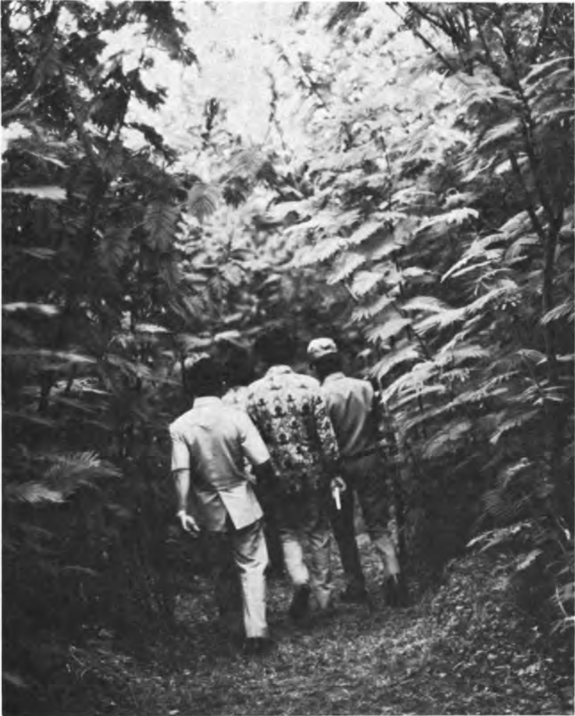
Trawas, East Java. One-year-old Perum Perhutani calliandra plantation on a formerly treeless area infested with Imperata grass. Under favorable conditions, plants this age may reach heights of 3-5 m (elevation, 700 m; annual rainfall, 2,800 mm; brown latosol and brown regosol soil).

to Sukiman Atmosudaryo, is to develop forests for the people and people for the forests. Foresters have to live with the environment, he says, and people are part of it.