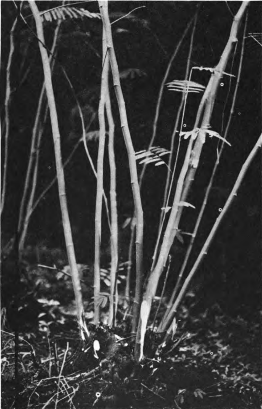
Calliandra coppices vigorously. Firewood has been harvested annually from this stump for more than 20 years. (The maximum number of rotations has not yet been reached.) After cutting the branches, 6-16 new shoots usually form quickly. The regrowth shown here is 8 months old. Yearly cuttings are possible. (N.D. Vietmeyer)