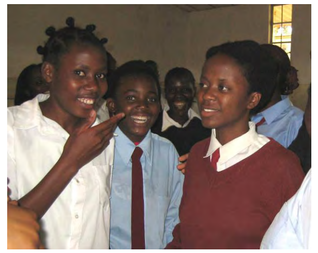
Participants engage in activities during the Peer Education Training at Choma High School, Southern Province

activities. Each Peer Educator was given activity manuals which have 39 participatory life skills-building sessions.