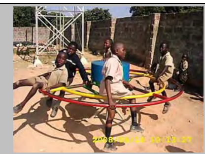
Kansuswa Basic School Play pump and Tank