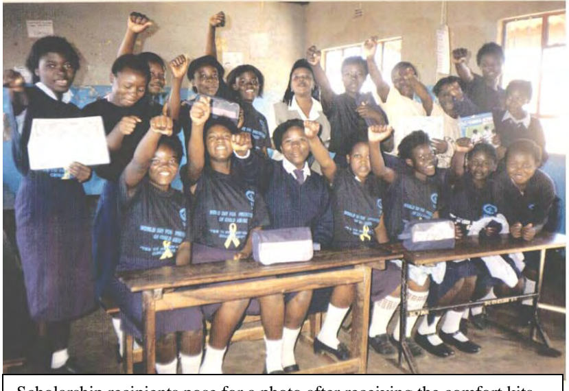
Scholarship recipients pose for a photo after receiving the comfort kits

Implementing partners continued distributing the comfort kits to female scholarship recipients. Overall, all the 3,500 female scholarship recipients received comfort kits. In partnership with the International Youth Foundation and with funding from Johnson & Johnson, an extra 3,500 comfort kits were produced and distributed to other vulnerable students who do not receive scholarships. Feedback from the recipients demonstrates the girls' gratitude, and they all indicated that the kits would improve their attendance as they would come to school even when they are having their menstrual periods. The use of comfort kits by girls on the scholarship has resulted in the improvement of personal hygiene, self-esteem, and regular class attendance. However, the general lack of water in some schools raised concern as some girls still missed school for that reason. The problem was most common in boarding schools in Eastern and Northwestern Provinces.