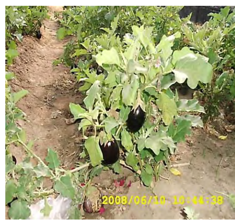
Gandhi Basic School Egg Plants grown from the school Garden

The installation of play pumps in a few schools on the Copperbelt has improved the livelihood of the people in the community while providing children with a fun activity.