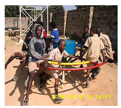
Children enjoying play as they go round on the play pump at Ndelela and Kansuswa Basic Schools in Luanshya