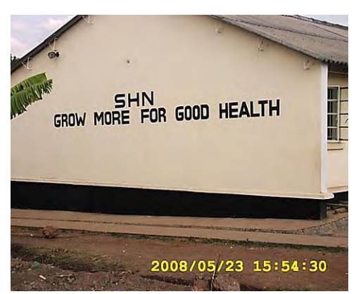
Lulamba Basic in Kitwe

One of the success stories on school gardens is that the schools are managing to use the gardens to feed children. This is a strength and shows that the schools have the potential to sustain school feeding programs if they are well-planned and supported by their communities. An example is Lulamba Basic School in Kitwe, where CHANGES2 officers witnessed a school feeding program. On this particular day a total of 62 school children (32 girls and 30 boys) were fed beans, vegetables, chicken and nshima. This school has maintained the school garden concept and pupils continue to benefit.