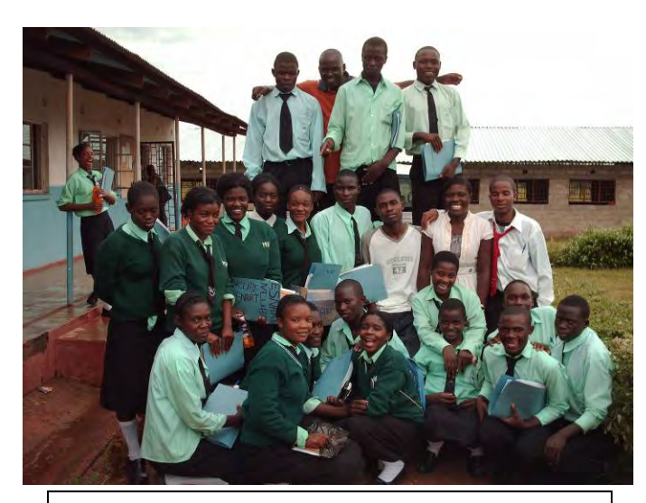
Peer Educators after the training at Mikango High

During the quarter, FAWEZA disbursed grants to high schools hosting SAFE Clubs. A total of 62 high schools received grants, 27 in Northwestern Province and 35