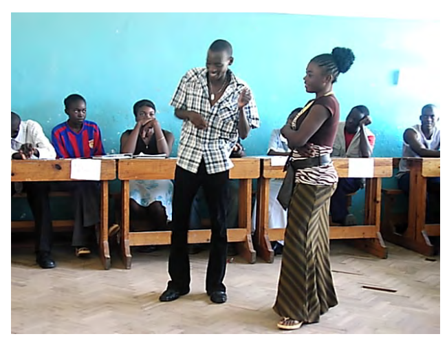
Participants present a role play at Fatima Girls High School, Copperbelt Province

While successfully completed, the trainings in Eastern and Northwestern Provinces proved to be more costly than expected due to the falling value of the dollar, the long distances between schools, which made clustering of schools impossible in many cases, and the need to have teams travel from the core provinces to conduct the trainings.