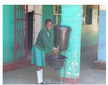
A clean School environment and hand washing facility at Chitanda Basic School in Lusaka District