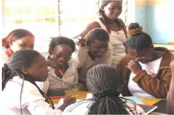
Students at Malcolm Moffatt COE involved in a Tutor-facilitated activity at the TWH training