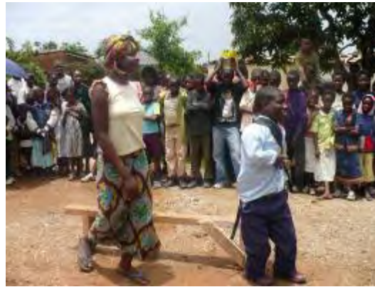
Sensitization drama by pupils at Kalikiliki Community School, Lusaka District

In addition, it was encouraging to witness how sustainable the SCP activities were in the 2006 and 2007 schools, despite minimal support from the CHANGES2 program. For example, the Shikoswe Community Youth group (SCY), which was mobilized by the SCP committee in 2006, continued directing the energies of youths to more meaningful and productive ventures as a way of deterring them from participating in activities that would lead them to contract HIV.