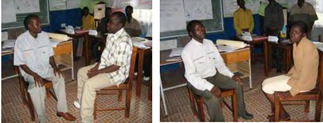
PSS training participants practice counseling skills during the training in Nchelenge