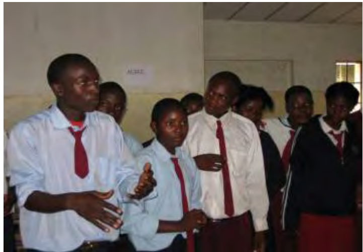
High school students debate sensitive issues at a peer education training at Choma High School

Many of the Trainers had been previously trained as Peer Educators, so their knowledge levels were generally very high. The training oriented them to the innovative model of Peer Education developed by CHANGES2. In typical peer education models, young people are trained in HIV and sexual reproductive health (SRH) knowledge, and then expected to talk to their friends informally and lead activities during assemblies. The Peer Educators being trained by CHANGES2 will be expected to facilitate structured interactive activities in the school AIDS Action or SAFE Clubs. The manuals, which are being distributed to each Peer Educator, give detailed instructions for 39 activities which deal with SRH knowledge, gender analysis, discussion of the cultural context of HIV/AIDS and adolescent sexuality and the development of life skills such as assertiveness, decision-making