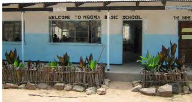
Ngoma Basic School also uses a school feeding program

Activities involving school feeding were mostly reported from Southern Province. As a result of negative weather patterns and conditions, almost all schools are devising strategies to address short term hunger at school. St. Vincent Community School in Monze has embarked on an initiative of feeding pupils mealie samp mixed with cow peas or with groundnuts grown from the school garden. The school is also running a poultry project and is able to give a boiled egg to each pupil at least once a month. This has boosted the nutritional status of children and has increased enrollment at this school. The hygiene standards where the food is prepared and people preparing food has also been paid special attention. The food is prepared in a hygienic environment. At Kayuni Basic School in Siavonga District, the people who work in the kitchen have been given uniforms. Such efforts by the schools have started paying off as we have witnessed the communities coming in to support the feeding programs. The schools provide labor for cooking and also contribute food, such as maize.