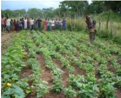
School Garden at Fiwila Community School in Mkushi District

Africare, in collaboration with CHANGES2 field officers and MOE staff, conducted support and monitoring trips to schools that had received school garden training last year. A total of 138 schools were visited. Among the schools visited, Central Province had the most, about 39 of which have performed very well and have even gone beyond what was expected. These schools have expanded and grown larger gardens from proceeds of the initial gardens that were established. They are now harvesting and selling most of the produce. As a result of the school garden activity, the MOE's school feeding program has also been strengthened due to the availability of food for needy children. Medicinal and pesticide trees, Neem and Moringa, have also been planted.