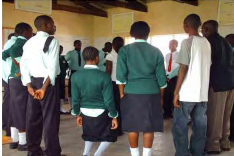
Peer educator training at Mikango High School

Many of the Trainers had been previously trained as Peer Educators, so their knowledge levels were generally very high. The training oriented them to the innovative model of Peer Education developed by CHANGES2. In typical peer education models, young people are trained in HIV and sexual reproductive health (SRH) knowledge, and then expected to talk to their friends informally and lead activities during assemblies. The Peer Educators being trained by CHANGES2 will be expected to facilitate structured interactive activities in the school AIDS Action or SAFE Clubs. The manuals, which are being distributed to each Peer Educator, give detailed instructions for 39 activities which deal with SRH knowledge, gender analysis, discussion of the cultural context of HIV/AIDS and adolescent sexuality and the development of life skills such as assertiveness, decision-making