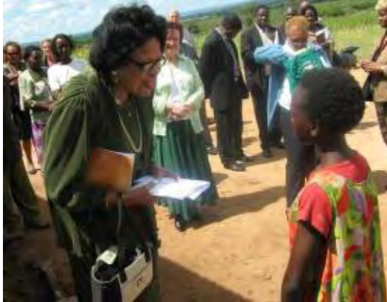
Congress Woman Watson thanks pupil for the speech and gift.

Congresswoman Diane Watson (D-CA) from the United States visited Mwandi Community School in Livingstone, Southern Province. She was part of a 13-person delegation that requested to see what impact USAID assistance is making in Zambia. Mwandi Community School has had education activities supported by CHANGES2 as well as by QUESTT with USAID funding.