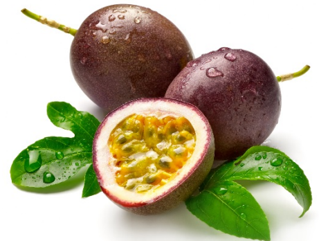
Purple Passion Fruit

The two most widely grown passion fruit varieties are the standard purple variety and the yellow variety distinguished as P. edulis f. flavicarpa . The yellow fruit generally has larger fruit than the purple, while the pulp of the purple is less acidic, richer in flavor and typically has a higher proportion of juice. Yellow passion fruit is more widely grown, though most producing nations grow both varieties. In general, the yellow variety is used for juicing or processing, while the purple variety is traded in its whole fresh form.