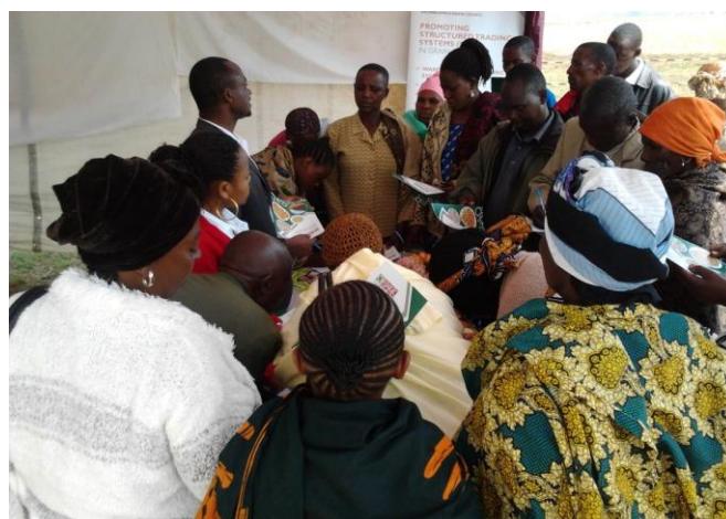
FARMERS BEING TRAINED DURING THE ARUSHA EXPO

In addition to the above, the Tanzania team in partnership with Ministry of Agriculture trained members of Jikuzeni Kware SACCO in Hai District (Kilimanjaro Region). 40 farmers who belongs to the SACCO received training on STS components-aggregation, group marketing, grades and quality standards and WRS.