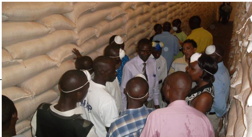
TRAINEES UNDERTAKING PRACTICALS AT THE AGROWAYS WAREHOUSE IN JINJA

The training took place in Jinja, from 17th to 21st September 2012 and a total of 20 fumigators from across the country were trained and examined. The training