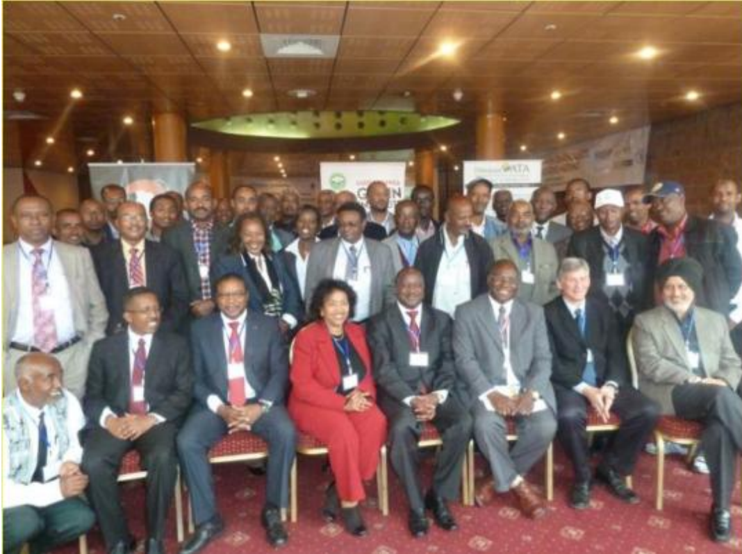
EAGC ETHIOPIA STAKEHOLDERS, IN ADDIS ABABA