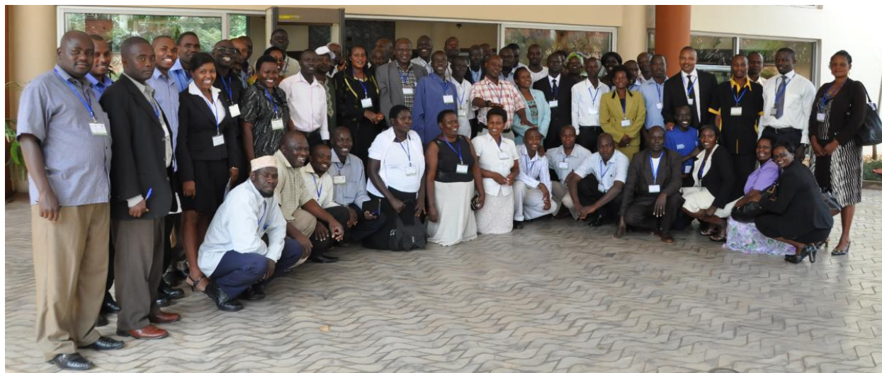
PARTICIPANTS OF THE ATAB MARKET LINKAGE WORKSHOP

Rwanda and Southern Sudan a networking platform to discuss business and establish formal market linkages. The event attracted 83 participants drawn from Kenya, Uganda, Rwanda, Democratic republic of Congo and Burundi. The participant responses and interactions illustrated great enthusiasm and commitment for establishing market linkages that would lead to the establishment of formal and sustainable market linkages across borders through the use of a well established trade platform RATIN.