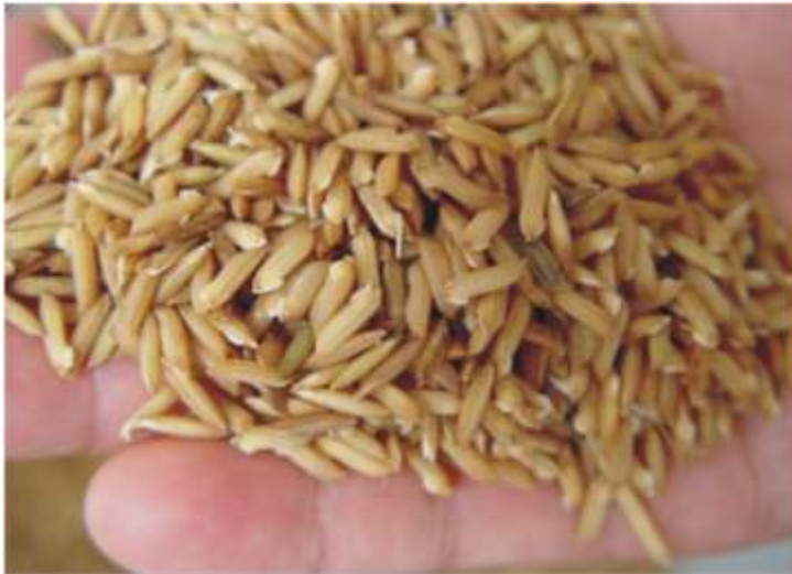
Use pre-germinated seeds