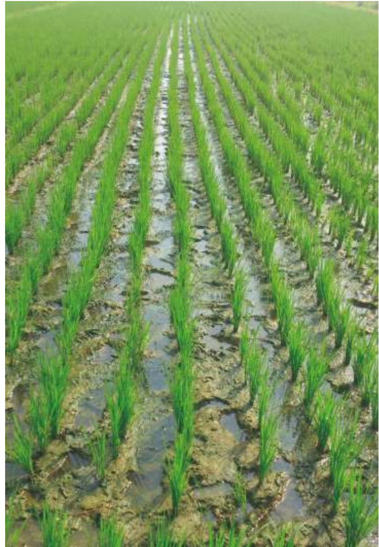
A healthy crop in a well levelled field

Land levelling ensures equal distribution of inputs to the field. Rice grows well and evenly in the entire field, and weed problems are minimal. The crop will ripen at the same time in the whole field and yield will be higher.