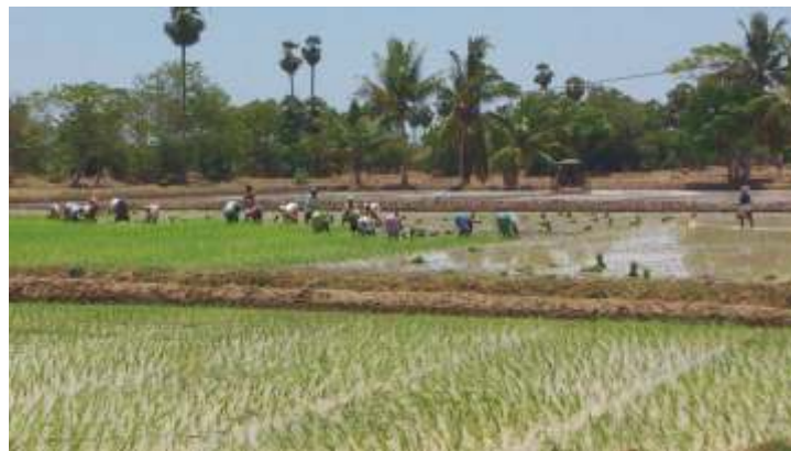
For uniform spacing, use planting guides made of jute rope with appropriate spacing. Maintain alley ways for ease of operation