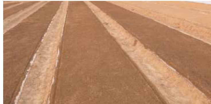
Use a well prepared seed bed for the nursery

Table below shows nursery management specifications according to area of main field