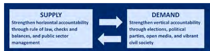
Figure 1. Supply & Demand in Anticorruption Initiatives

Through these many channels, accountability reforms strengthen institutions in government and society and foster structured competition in politics and the economy.