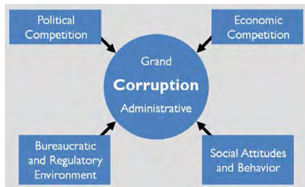
Figure 4. Corruption Dynamics and Access Points for Response (from USAID Anticorruption Strategy)

The sector-based Corruption Diagnostic Guide of USAID's Anticorruption Assessment Handbook can be an instrumental tool for pinpointing corruption vulnerabilities and the need for specific interventions for sectoral program. The Guide currently consists of detailed diagnostic questions for 19 sectors that allow policies, procedures and practices in a particular sector or function of government to be assessed. Questions are also included to examine corruption vulnerabilities and assess the capacity and readiness of civil society organizations, the business community, and the media to contribute to anticorruption efforts. The Diagnostic Guide can be expanded or modified and similar sets of diagnostic questions can be developed for other sectors and function as needed. Often, anticorruption programming in a particular