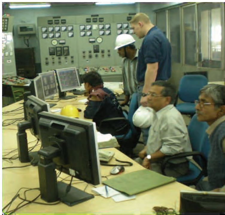
U.S. expert monitoring the combustion process at Control Room, Kolaghat, West Bengal under APP.

The program has also established a culture of efficiency at NTPC and partner state electricity board plants.