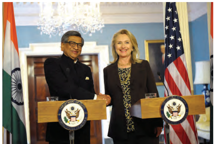
U.S. Secretary of State Hillary Rodham Clinton with Indian External Affairs Minister S.M. Krishna.

India's Minister of External Affairs Shri S.M. Krishna and U.S. Secretary of State Hillary Rodham Clinton met in Washington, DC, on June 13, 2012, for the third annual U.S.-India Strategic Dialogue and reaffirmed their countries' strong commitment to work collaboratively in clean energy and low carbon technologies.