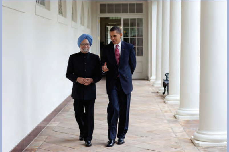
U.S. President Barack Obama with Indian Prime Minister Manmohan Singh.

In 2012, the United States Agency for International Development (USAID) commemorated 50 years of development assistance to India, totaling over USD 52 billion. This assistance has contributed to India's growth story. Over the past 50 years, USAID/India's development assistance program has evolved from one that directly distributed food and constructed large-scale infrastructure projects at the macro-level, enabling it to achieve national-level dynamic impact, to one that introduced best international practices to improve the delivery of goods and services to targeted beneficiaries at the state and local levels.