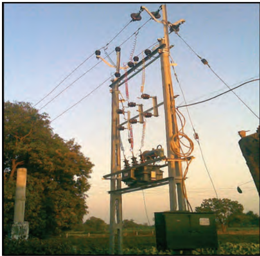
High Voltage Distribution System (HVDS) work at 11 KV Baroda feeder at pilot site Umreth, Gujarat.

The Distribution Reform, Upgrades and Management (DRUM) program, launched in 2004, was conceptualized jointly by the Indian Ministry of Power and USAID to accelerate power distribution reforms in India. DRUM's key objective was to create "model distribution systems" in certain states. New technologies were tested at three different pilot "Centers of Excellence" - one urban site in Aurangabad, under the Maharashtra State Electricity Distribution Company Ltd. (MSEDCL); and two rural sites under the Bangalore Electricity Supply Company (BESCOM) in Karnataka; and the Madhya Gujarat Vij Company Ltd. (MGVCL) in Gujarat.