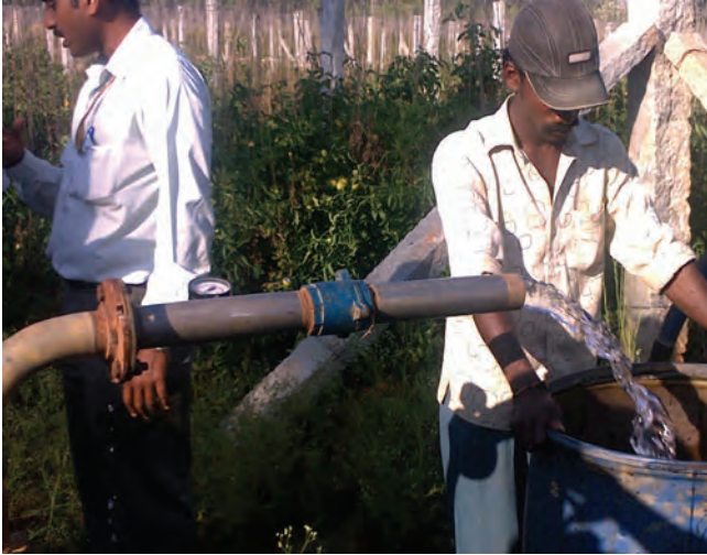
Monitoring of water discharge from energy efficient pump set at the pilot site.

The Water-Energy Nexus Activity (WENEXA) focused on improving the co-management of energy and water resources in agriculture, urban and industrial sectors through enhanced power distribution and end use efficiency. The project had a positive impact on the quality of life for participating stakeholders, particularly farmers, by helping them to reduce costs and increase income. WENEXA provided technical assistance and training to BESCOM and other stakeholders. It also: