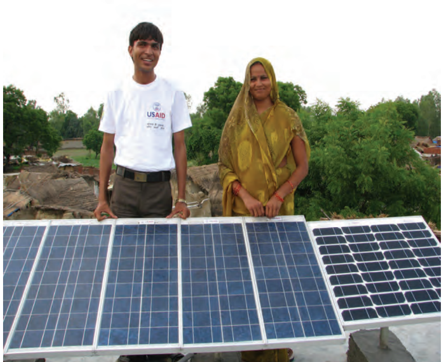
Solar charging panel at a women entrepreneur’s residence in a U.P. village.

The project focused on empowering women economically and socially by providing them training in starting up solar station businesses; and also providing quality illumination based on solar energy to rural households. The project led to the establishment of 300 self-help groups and provided training to improve their livelihood. The program also sensitized children and youth through an environmental education program.