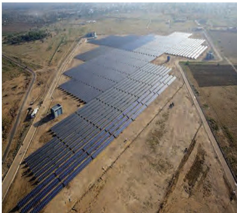
OPIC and Ex-Im Bank will support large solar projects such as the 5 MW grid connected solar power plant at Khimsar village, Rajasthan.

OPIC has approved/committed USD 741 million to clean energy projects in India since 2009 and leveraged an additional USD 825 million in private debt and equity.